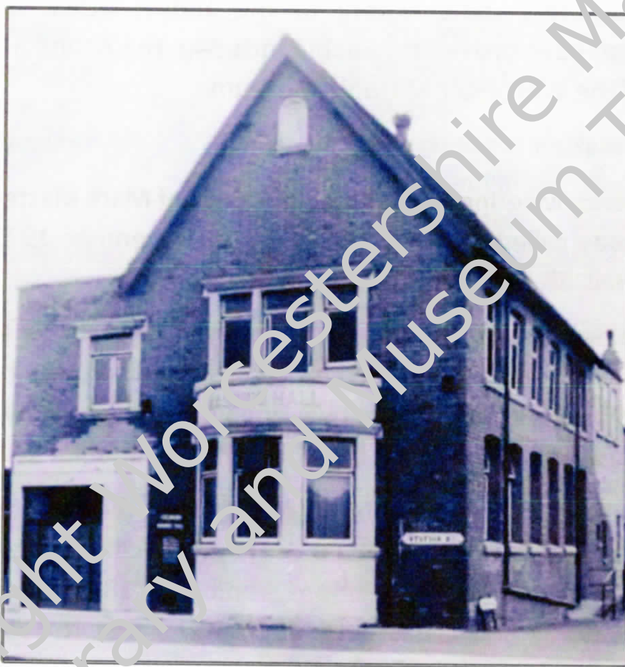
Stechford Masonic Hall, Station Road, Stechford