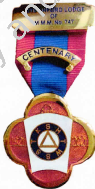
Centenary Jewel 2021