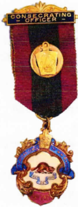
Consecrating Officers Jewel 1921