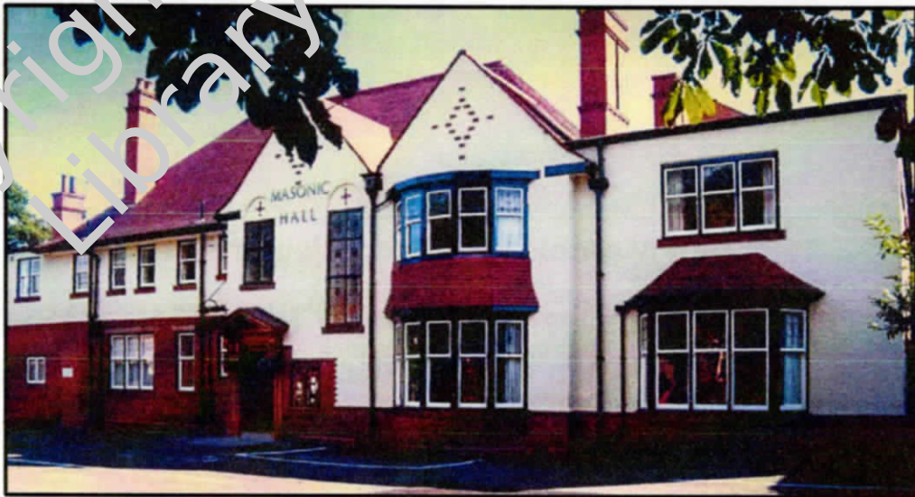
Kings Heath Masonic Hall, Kings Heath, Birmingham

A room on the first floor there, then being used as an office, was available.