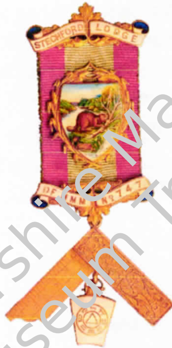
Past Master's Jewel